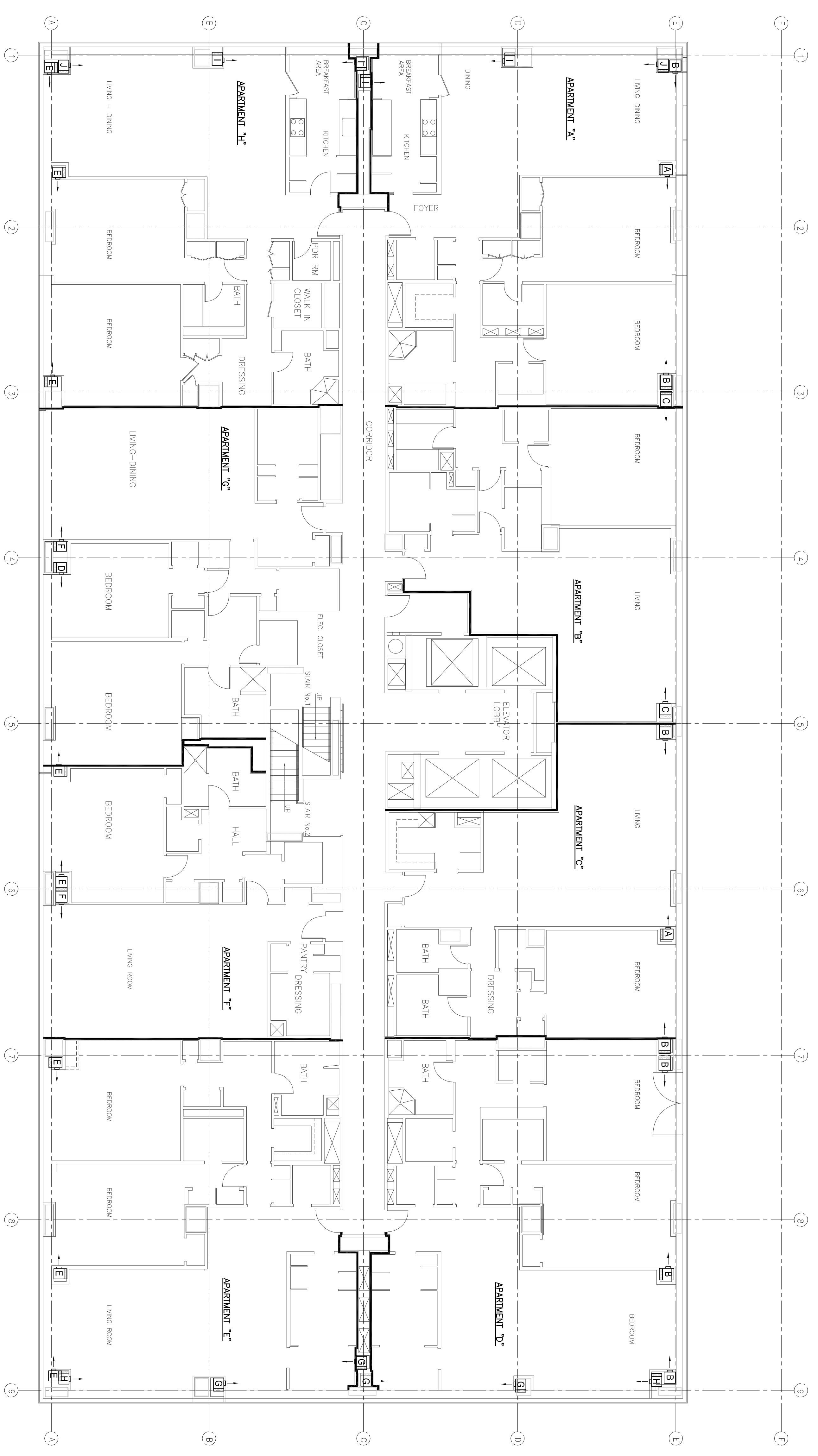
23RD THRU 48TH FLOOR MECHANICAL PLAN SCALE: 3/8" = 1'-0"